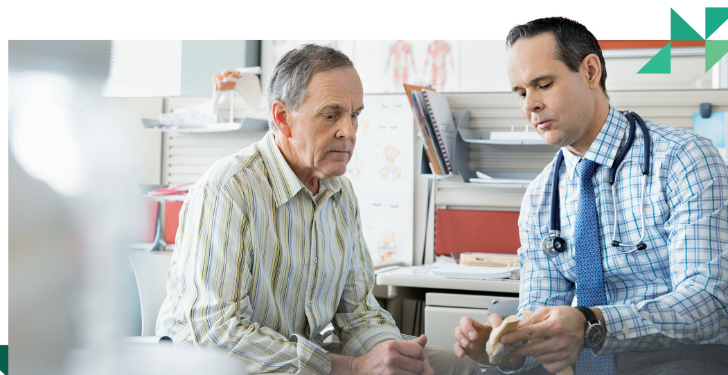
Not actual patient.

Please see full Important Safety Information for VOTRIENT® (pazopanib) tablets on pages 12-14.