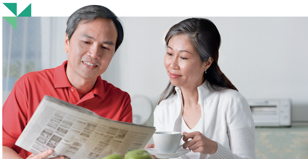
Not actual patient.

Keep a list of all the medicines you take, and show your list to your health care provider and pharmacist each time you get a new medicine.